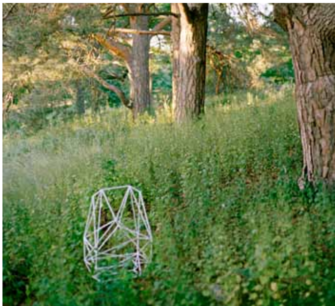
Geoffrey Pugen, Sphenoidal Forest , 2010

An intuitive artist working in a conceptual framework, Pugen weaves together thematic and narrative threads without insisting on exposition. The role of intuition, as an elusive yet seemingly instinctual drive existing outside of both mind and body, has shaped the story of Bridge Kids , as has Pugen’s interest in Parapsychology. Intuition figures in the myriad decisions involving materials, processes, and research that constitute a cohesive work of art. The notion of extra sensory perception—the capacity to see beyond the immediately perceptible—precludes the making of something from nothing: the engineering of a number of variables into a fully realized state. In a sense, each act of art making is an attempt at clairvoyance, a reconciliation of thought, idea, and the imaginary with reality. However Pugen fuses intuitive art making processes (like the invention