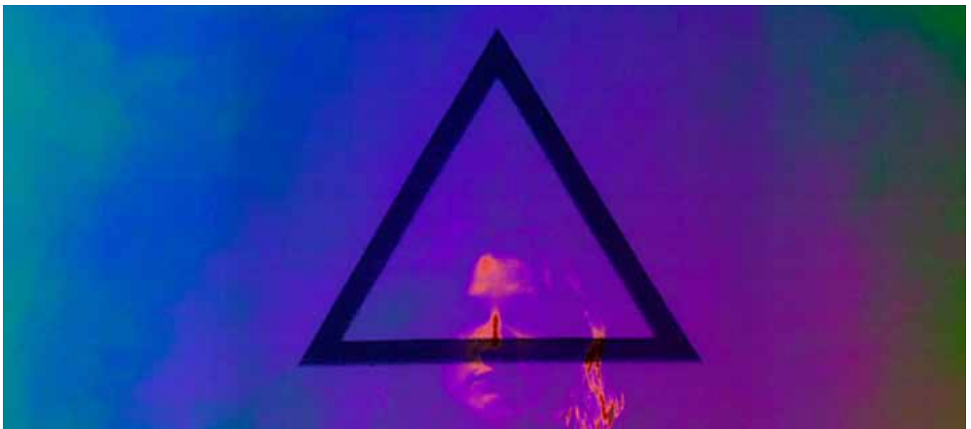
Geoffrey Pugen, still from Bridge Kids , 2010

Pugen reconstitutes the rhetoric of the daytime melodrama with a characteristic still image montage and typical television studio camera set-ups, though he has carefully disrupted its formal rigidity by reversing the theme song from The Young and the Restless and through layered editing. Cryptic in its message, the soap opera only drops