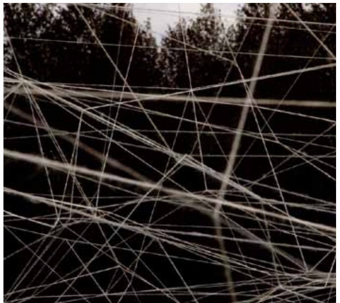
Geoffrey Pugen, String Matrix , 2010