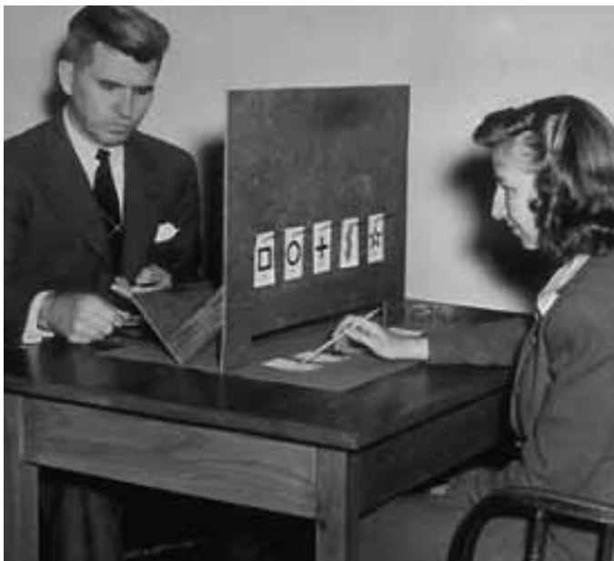
J. B. Rhine uses Zener Cards to test a woman for ESP

Governing the ideas that circulate through Bridge Kids is the conceit that, in the future, human beings will remain in a perpetual state of childhood, possess uncanny forms of intuition and psychic perception, and be devoted to recovering the loss of history by engaging in the study of media designed to retrieve the past. The film principally focuses on Kathy, a pre-adolescent student (though the age of these characters is ultimately ambiguous due to their arrested physical development) whose class project on Julia Denzig turns into a psychic connection allowing her to bring forth Denzig's possessions, and possibly Denzig